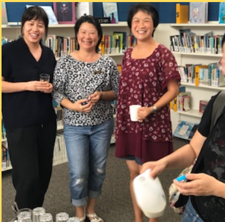
ESOL Parent Meeting